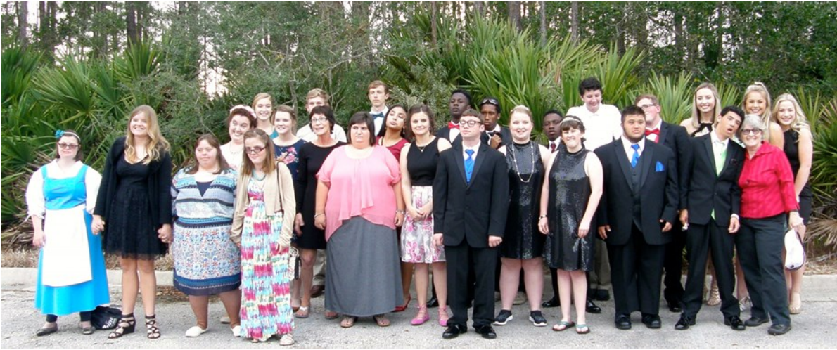
Pedro Menendez Best Buddies pose before going to the Best Buddies Friendship Ball on March 10th. The ball, themed “Be Our Guest”, was attended by students from the greater Jacksonville area.